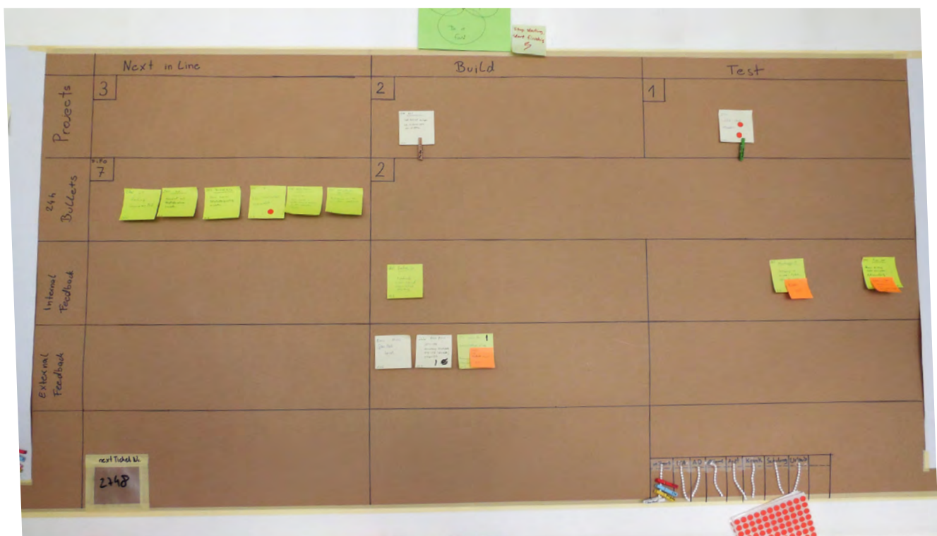
The IT department’s Kanban board, the structure of which has not changed much since it was first created. The top row is reserved for tasks related to projects; below that is a row for maintenance tasks, which usually take no longer than a day; the third is a parking lot for tickets that need feedback from an internal source; the fourth row is a parking lot for tickets awaiting external feedback.