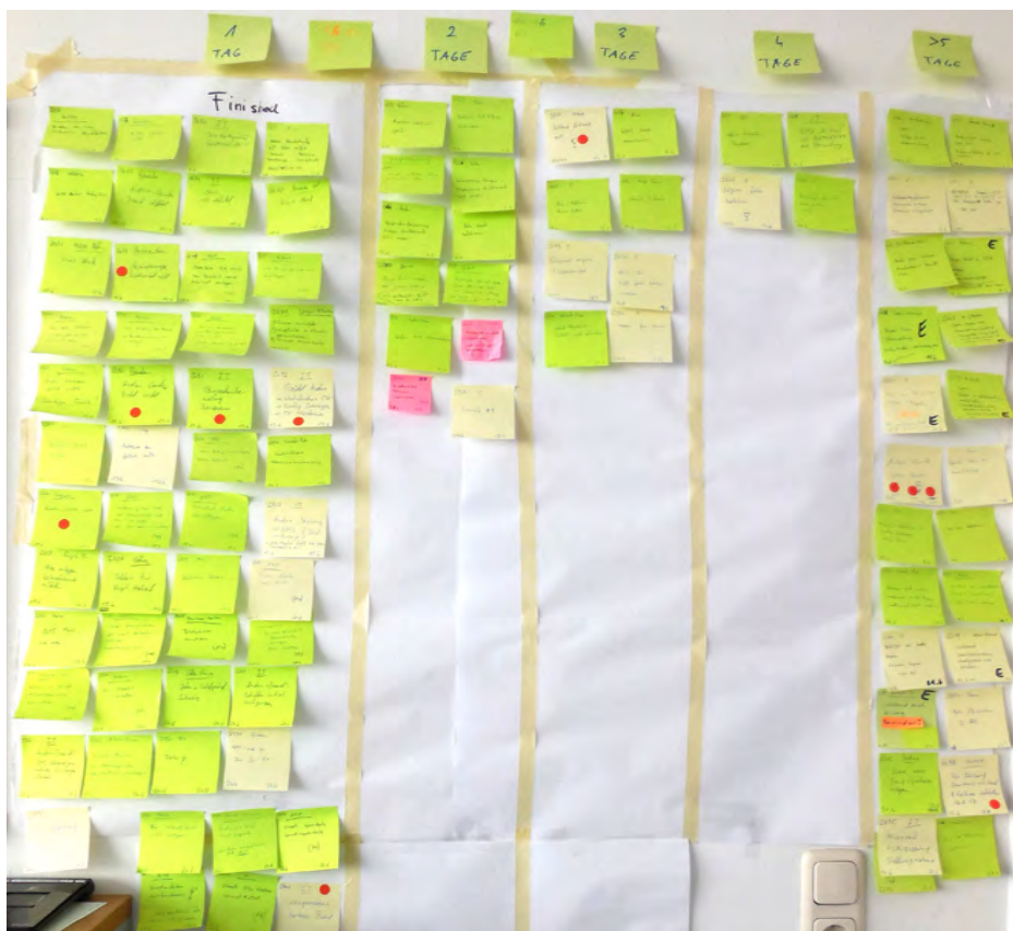
This board serves as a histogram of work that has gone through IT; it indicates how long each ticket was in process.

and prioritization issues quickly and without disruptions. “One of the things that really annoyed the internal clients was that when their task was done, nobody from IT actually told them. The people on the team were just too busy to give feedback, but to an internal client it might have seemed as if they were doing it on purpose,” Eric-Jan describes. Having witnessed the improvements on the factory floor,