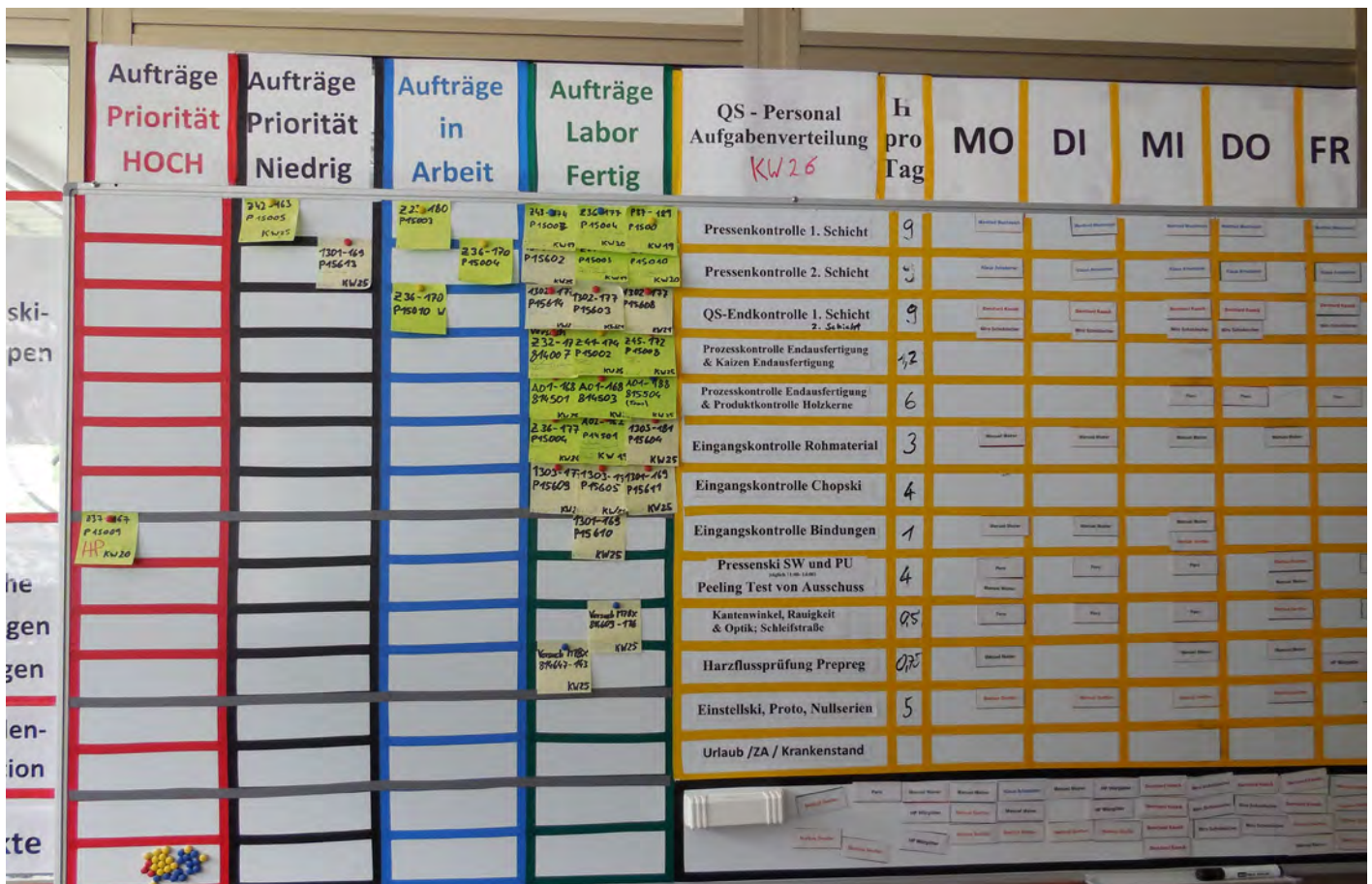
This Kanban board keeps track of the quality tests for various pairs of skis. Inspired by IT’s Kanban board, it is one of the latest improvements on the manufacturing floor.