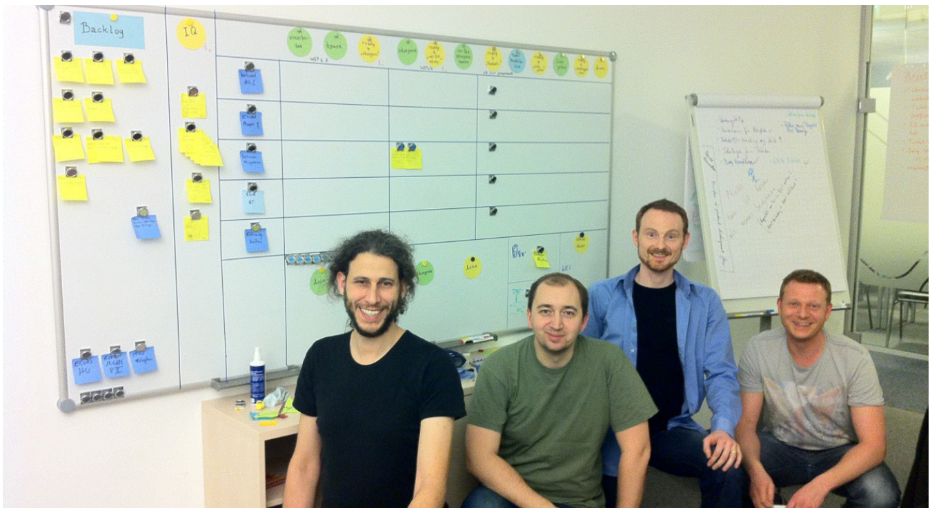
Figure 2 - The first ever Kanban board.

“My purpose as a coach was to get them out of the habit of just working without paying too much attention and get them into a conscious and mindful state where they could differentiate what was meaningful,” Klaus says.