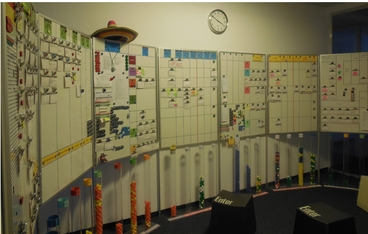
Figure 1 - The Kanbanraum.